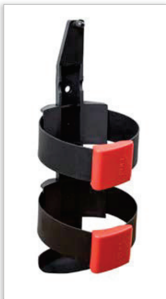
GLORIA's car bracket and patented security strap