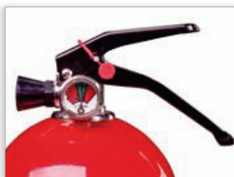
GLORIA PD 2 - valve look