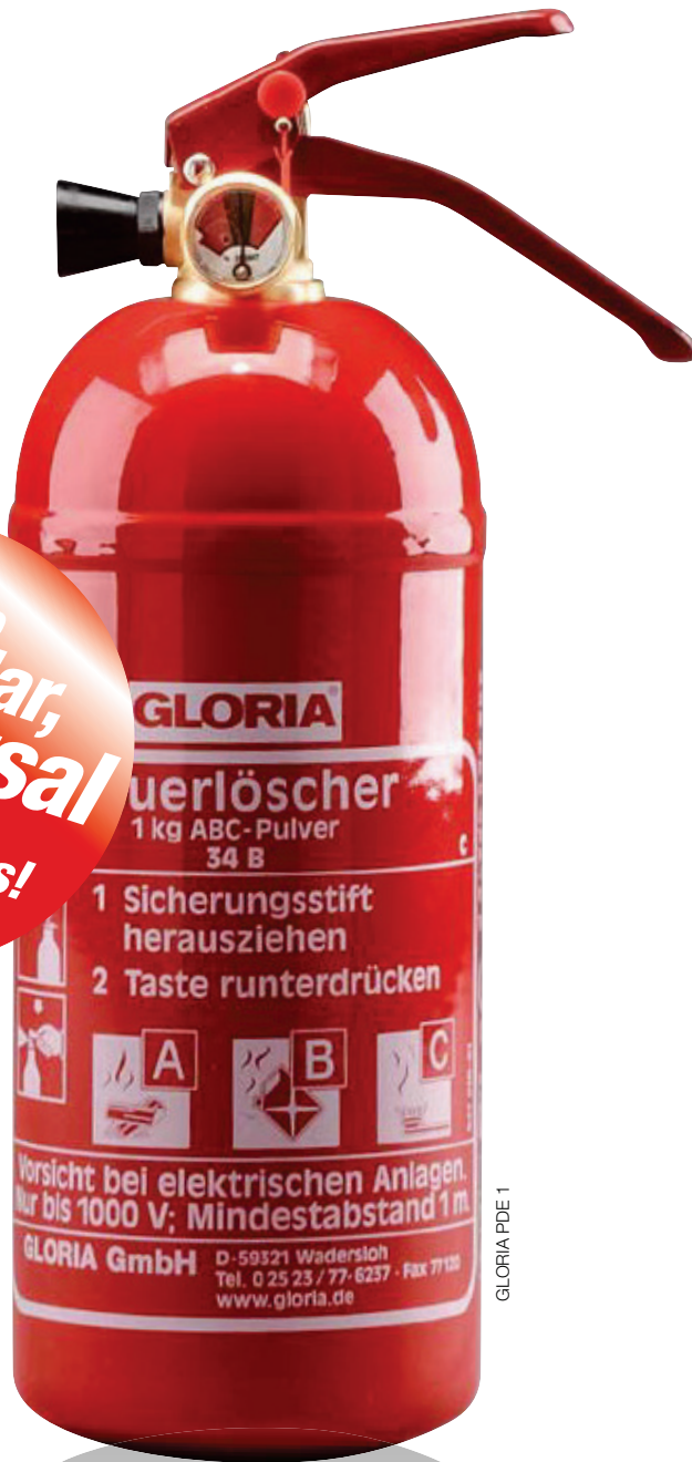
GLORIA PDE 1

The popular, universal fire extinguishers!