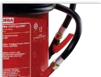
GLORIA SKK 50 - the rotating screwed nozzle.